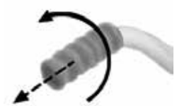
Turn Anti-clockwise to lengthen arm